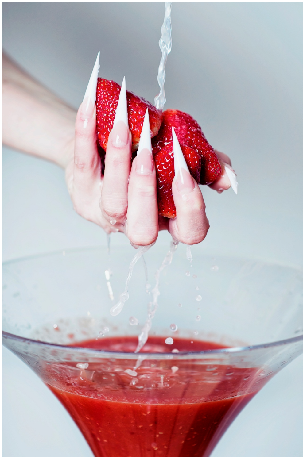
Nails by Ania Kesiak (1 st Place)

Example of Photographic Classic Nail entry from Scottish Nail Tech 2014 – Theme 'Cocktail Hour'