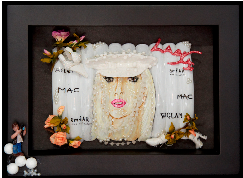
By Adriana Onofrei (1 st Place)

Example of Boxed Nail Art Mixed Media Irish National Nail Tournament 2015 – Theme 'Red Carpet'